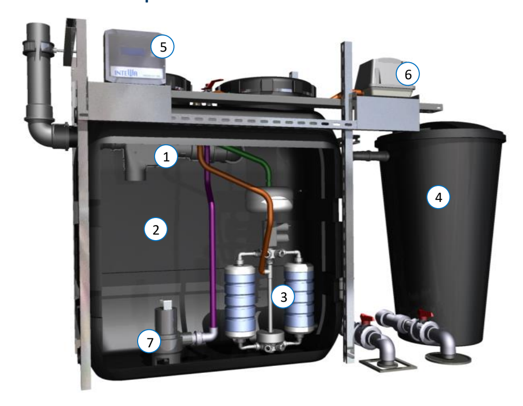
Figure 1: Overview: Packaged system AQUALOOP Greywater Recycling System 600 I/day Note: metal rack, drainage pipes, aerator hoses on site