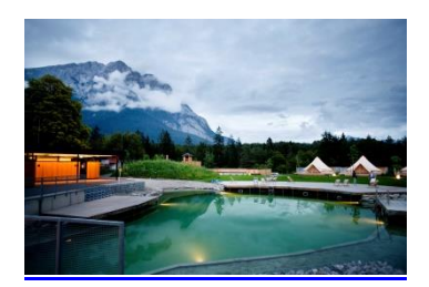
Campsite in Austria

https://www.intewa.com/en/references/campsite-gerhardhof-relies-on-sustainable-use-of-grey-water/